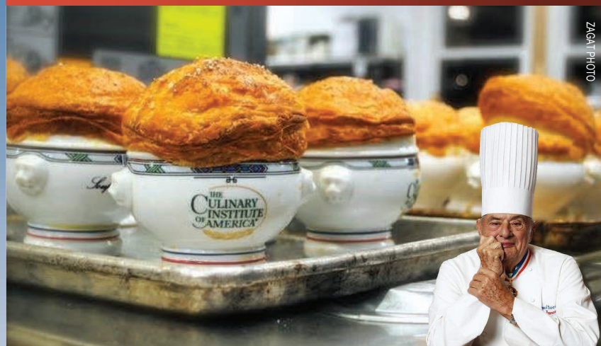
Chef Paul Bocuse 1926 - 2018 inset over his black truffle soup

Wednesday, October 17 • 11:30am • $90 • Coach loads at 9:15am