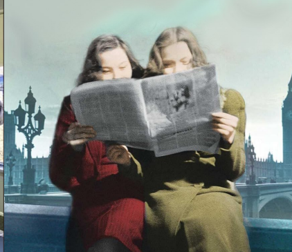
READ IT + SPEAK