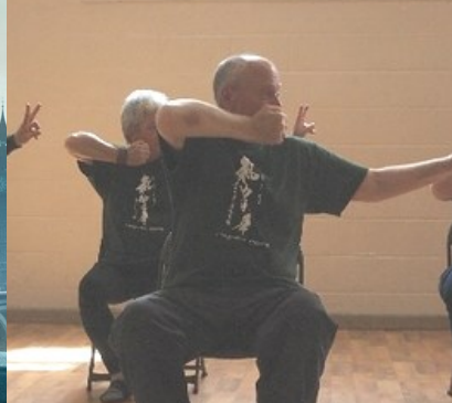
A BALANCED LIFE