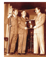
Glenn Miller presented with the first gold record ever awarded for the hit single Chattanooga Choo Choo in 1942

In 1938, Glenn Miller formed what would become the most popular swing band in history. His musical arrangements featured a clarinet and tenor sax playing in unison and three more saxophones harmonizing within a single octave — a sound that separated the orchestra from its contemporaries and made it instantly recognizable, even today. The Glenn Miller Orchestra charted over 70 top ten hits, and made two major motion pictures. Miller enlisted in 1942 and led the Army Air Force Band until his plane disappeared over the English Channel in December, 1944. The current band, officially recognized by the Glenn Miller Foundation , performs at more than 300 concerts per year around the country.